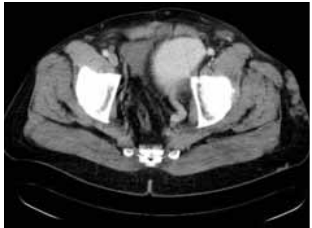
Fig. 2. A large venous aneurysm on a Computed axial tomography scan study.