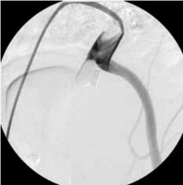
Fig. 3. Angiogram showing the occlusion of the arteriovenous fistula by the balloon staying in the lumen of the internal iliac artery with the support of a stent.

Thrill disappeared after ligation of this segment of the artery. Piece of the internal iliac artery that includes the fistula orifice was oversewn from outside. The venous aneurysm that mainly originated from the left internal iliac vein was left in place for the venous drainage of the left leg since it also constituted a long segment wall of the external iliac vein.