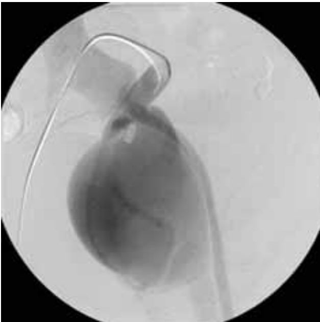
Fig. 1. Digital subtraction angiography showing a large side wall arteriovenous fistula between the proximal portion of the left internal iliac artery and the iliac veins.

Surgical technique. After a midline laparotomy and release of dense adhesions, bowels were mobilized. Large venous aneurysm filling the small pelvis was seen. Inferior vena cava and iliac veins were pulsatile. Distal abdominal aorta, left common and external iliac arteries were freed and looped with a vascular tape (Fig. 4). Fistula orifice was located at the proximal portion of the left internal iliac artery, 1 cm distal from the bifurcation. This portion of the artery could be dissected free with the scalpel due to dense adhesions. Intermittant clamping of the left common iliac artery to reduce the pressure and volume in the venous aneurysm revealed better exposure. Distal portion of the internal iliac artery could not be reached since it was embedded to the wall of the venous aneurysm. After heparinization, left common and external iliac arteries were clamped. Short proximal neck of the internal iliac artery could be clamped over the previously placed stent. This artery was amputated by leaving a small rim of wall and the defect at the bifurcation was primarily closed by linear suturing. Stent was quickly removed during a brief period of declamping. It was noted that the thrill over the fistula was still present. The portion of the internal iliac artery distal to the fistula was carved out by scalpel.