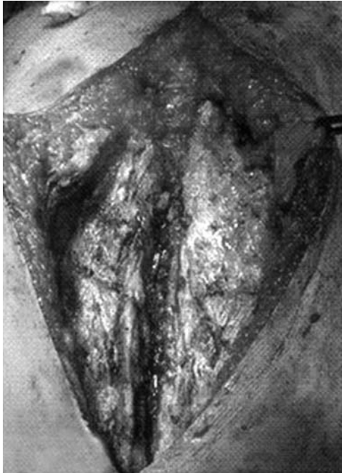
Fig. 1. Pseudoarthrosis and fractured bone materials are carefully cleared along the sternum. The edges of the sternum should be free from the adhesions.