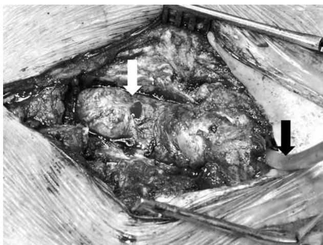
Fig. 1. Median sternotomy incision showing the retrosternal position of the stomach (white arrow) with nasogastric tube inserted at the anastomotic dehiscence site anteriorly (black arrow).

Controversy exists with regard management of the esophageal defect. Mediastinitis and death may result from neglect of this condition. From our experience, we agree with others that conservative management is of no help especially in non-compliant patients like ours. [8,9] In our patient, esophageal exclusion and debridement were considered the best management followed by restoration of esophageal continuity with gastric pull-up. We used a pectoral myocutaneous flap for secondary esophageal reconstruction when anastomotic dehiscence at the upper anastomosis of the gastric pull-up had occurred.