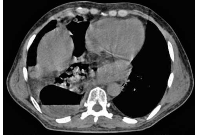
Figure 2. The stomach, omentum, and colon is seen in the right chest.

Short esophagus may occur in association with hiatal hernia and a long history of gastroesophageal reflux disease. If present, short esophagus must be taken into account before performing a fundoplication operation as it may create excessive tension along suture lines with a standard anti-reflux procedure and increase the likelihood of recurrence. [2] Some authors report incidences as high as 80% in massive (>5 cm) paraesophageal hernia cases. [2,3] In this case, our patient also had a shortened esophagus due to a large (6 cm) hiatal hernia, so we felt the necessity to add a gastroplasty. There is no consensus on the technique of initial crural repair. Some authors state that mesh repair should be reserved for cases where primary crural repair is not possible, but others advocate a more liberal approach. [4,5] There are some reports which state that intraoperative measuring of the hiatal surface area may help in the patient selection process and decrease the incidence of recurrence. [6] The overall impression is that mesh closure can be performed with few complications which usually require no secondary surgical intervention, but there are situations resulting in the erosion of prosthetic material which necessitate esophagectomies and gastrectomies. [7] Further studies