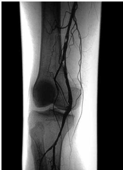
Figure 1. Preoperative angiographic image.

Ten days later at the outpatient clinical control, the patient reported a remarkable decline in his symptoms. Another physical examination revealed that the right popliteal artery and distal pulses were palpable but weaker compared with the contralateral extremity. A right popliteal magnetic resonance imaging (MRI) was