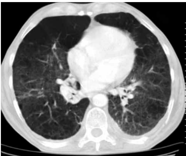
Figure 2. Chest computed tomography showing an obstructing lesion in the right lower lobe bronchus with post-obstructive atelectasis and part of the giant bulla in the right upper lobe.

our clinic with chest pain, coughing, and dyspnea. He was dependent on oxygen (6 liter/minute). The patient had been on bronchodilators for many years with no improvement in his symptoms. A chest X-ray revealed a giant bulla in the right hemithorax (Figure 1). In addition, chest computed tomography (CT) revealed an enlarged subcarinal lymph node (LN), an underlying diffuse emphysematous lung, a giant bulla in the right upper lobe, an obstructing lesion in the right lower lobe bronchus with post-obstructive atelectasis, and consolidation (Figure 2). The patient was hypoxic in