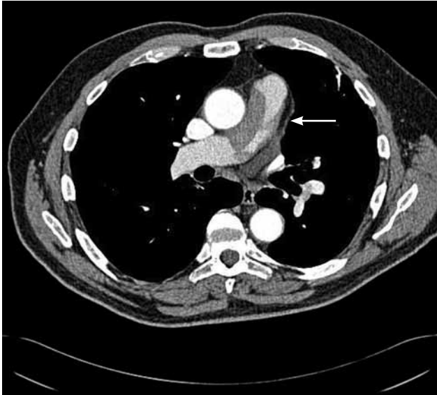
Figure 1. Preoperative computed tomography scan demonstrating the lesion in the main pulmonary artery (arrow).

the possibility of the obstruction being a pulmonary embolism (PE) since it was located so close to the main PA.