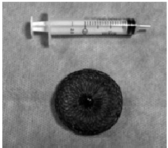
Figure 3. Macroscopic image of the removed device.

Thanks to advanced techniques and imaging devices, diagnosis and treatment of congenital heart diseases can be readily performed; therefore, the number of adults identified with a congenital heart disease has gradually increased. One advantage of transcatheter obstructive devices, which are now a part of routine therapy for congenital heart diseases, is that they can be closed without surgical intervention. In addition, they can also be used for certain congenital heart diseases like ASD, patent foramen oval, ventricular septal defect, and patent ductus arteriosus. [1] The percutaneous catheter closure procedure is not the only option for the closure of congenital heart disease, but