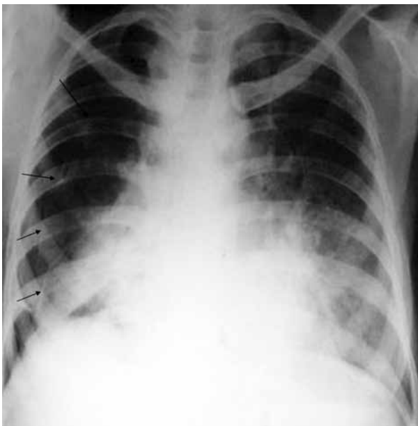
Figure 2. Chest X-ray showing the second right pneumothorax (arrows).

The possibility of a recurring spontaneous pneumothorax in pregnant women is 30-40%, with the majority occurring during the same pregnancy or in the postpartum stage. [2,3] In their report, Terndrup et al. [4] noted spontaneous pneumothoraces during