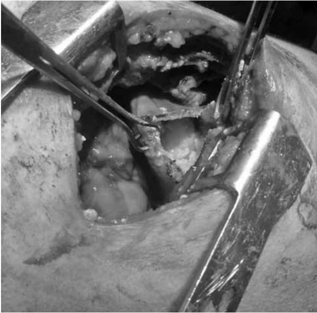
Figure 4. Operative view of the third case showing the diaphragmatic rupture of the hydatid cyst.

showed exophytic elongation. Moreover, no distinction could be made between the posterior border and the liver in this patient (Figure 2).