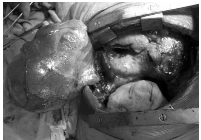
Figure 3. Gross appearance, the external surface of the cyst was smooth.

In the anterior mediastinum, tumors and cysts of a thymic origin, germ cell tumors, parathyroid adenoma, lymphoma, and intrathoracic goiters are prevalent. [1] The thymus develops from the third pharyngeal pouch together with the inferior parathyroid glands at the fifth week of gestation. The developing thymus maintains its close relationship with the parietal pericardium and descends with the pericardium between the 7 th and 8 th gestational weeks to assume its characteristic location in the