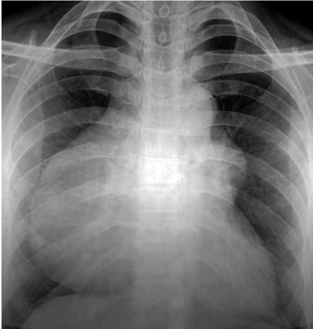
Figure 1. A chest X-ray showed a homogenous opacity in the anterosuperior mediastinum.

was abutting the mediastinal vascular structures, anterolateral chest wall, and anterior pericardium via a fat plane, and tiny, discrete foci of fat densities were seen within the lesion. In addition, a curvilinear segment of collapse was visible adjacent to the lateral margin of lesion, but there was no evidence of any abnormal calcification (Figure 2).