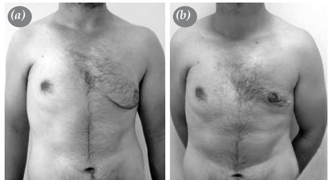
Figure 1. (a) Photograph of the anterior chest wall showing the absence of the sternocostal head of the right pectoralis major muscle along with the left-sided gynecomastia. (b) Photograph of the anterior chest wall after correcting the gynecomastia.

may also be present. [1] Gynecomastia is the benign enlargement of the male breast, and to the best of our knowledge, only one patient with both Poland's syndrome and gynecomastia has been reported in the literature. [2] However, to the best of our knowledge, our patient was the first to be diagnosed with the combination of Poland's syndrome, Sprengel's