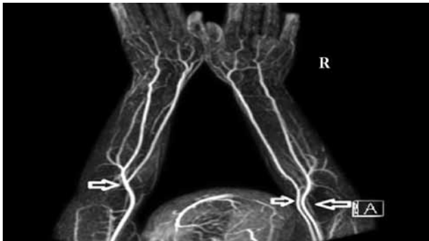
Figure 1. Upper extremity magnetic resonance angiography image showing the right brachial artery duplication with radial and ulnar arteries.