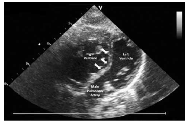
Figure 1. A two-dimensional echocardiographic image showing significant left ventricle (banana-shaped left ventricle).

He needed for revision on postoperative day zero due to the drainage (>100 cc/hour for 3 hours). No major bleeding was observed in the surgical area. He was revised for mediastinal irrigation of drainage tubes and exploration of infection signs. There was no mediastinitis findings. Clinical and hemodynamic variables such as dimensions and ejection fraction of the left ventricular, aortic velocity, and time integral were used for weaning. The ventilation and inotropic support were maximized and ECMO flow rate was gradually lowered. Urine output (1 mL/kg/h) was accepted as sufficient and the lactate levels are primary variables for clinical observation. The chest was left open for additional 24 hours. Then, the sternal and skin closure was performed. The ECMO support was reduced gradually and the patient was