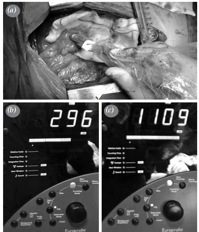
Figure 2. (a) Radioactivity count was obtained from surgical area. (b) Lower counts were obtained from normal tissues. (c) Higher counts were obtained from region consistent with focal activity accumulation on parathyroid scintigraphy.

area using various-angled intraoperative gamma probe (Europrobe). Whilst 250-300 cps ground activity was obtained from the normal tissues because of mediastinal blood pool, higher counts (approximately 1000-1500 cps) than ground activity were obtained from the region consistent with the area observed on preoperative parathyroid scintigraphy (Figures 2a-c).