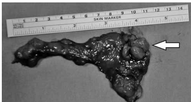
Figure 3. Specimen showing peripherally localized lesion was reported as parathyroid adenoma pathologically.

Whilst the tumor was located inside the soft tissue and it was not possible to distinguish the tumor, entire soft tissue in the left side of thoracic midline was widely excised under the guidance of gamma probe (Figure 3). Although intraoperative PTH monitoring was reported to be meaningful to ensure the total removal of the responsible lesion, we could not measure the intraoperative PTH because of the lack of equipment at our hospital. Serum calcium (8.9 mg/dL) and PTH (19 ng/L) values were within the normal ranges in the first postoperative day. The patient, of whom histopathological examination of the excised specimen revealed parathyroid adenoma, was discharged on the postoperative day seven, uneventfully.