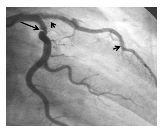
Figure 4. Follow-up angiogram showing a TIMI-III flow provides (an anterior oblique caudal projection) (two small arrows) (on Day 9). Repeated angiogram showing healing of an intracoronary thrombus. At six months and one year, respectively, angiogram showing a healed intracoronary flap. The arrows show a TIMI-III flow from patent circumflex (long arrow) and left anterior descending coronary artery (small arrows).

According to the ACC/AHA guideline, if the coronary artery dissection involves the left main coronary artery, CABG should be the initial treatment strategy.<sup>[10]</sup> A surgical approach has been also considered the first-line treatment modality, when multiple vessels are involved. In case of PCI failure,