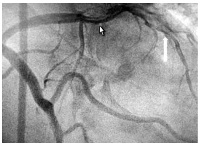
Figure 3. Initial angiogram (left anterior oblique caudal projection) showing dissection of anterior descending artery (small arrow). There is no sign of dissection of circumflex artery (long arrow).

Peripartum SCAD is a rare condition in postpartum period. There is no common consensus on the optimal treatment strategy. The mortality rate for patients with SCAD in the peripartum period has been estimated as 38%.<sup>[7]</sup> Herein, we present four PSCAD cases and discuss varying treatment strategies. We believe that our findings generated some important information on how best to approach PSCAD cases. First, coronary artery dissection must be considered,