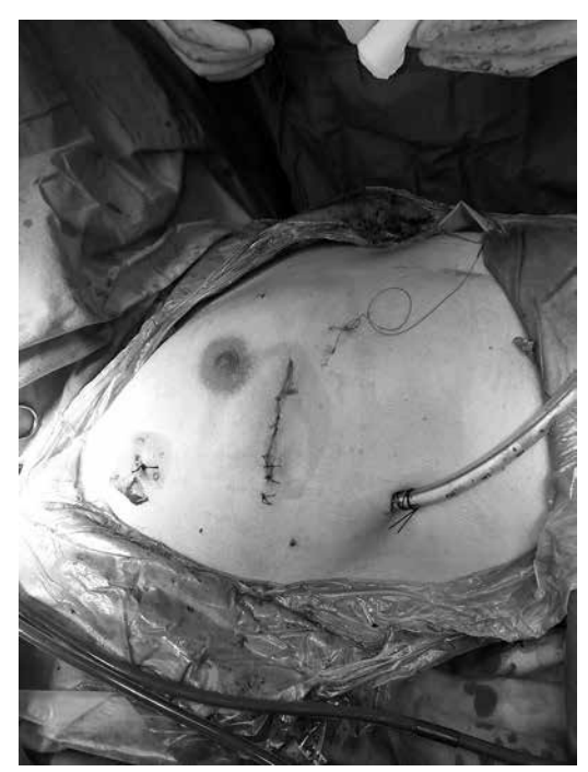
Figure 4. A postoperative image of closure.

In addition, there were no significant differences in the ratio of morbidities and mortalities between two groups. The mean amount of postoperative transfusion did not also differ between the groups (120.3\pm245.8 \text{ mL vs. } 393.6\pm519.4 \text{ mL}, \text{ respectively;})