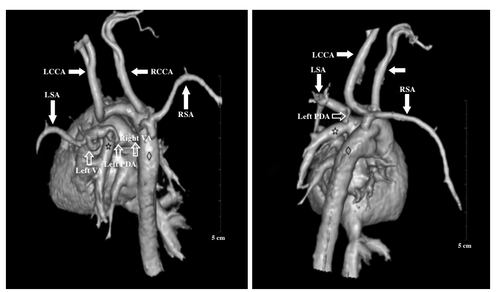
Figure 1. Computed tomography angiography showing an isolated origin of LSA from LPA via a left-sided PDA.

LCCA: Left common carotid artery; LSA: Left subclavian artery; RCCA: Right common carotid artery; RSA: Right subclavian artery; VA: Vertebral artery; PDA: Patent ductus arteriosus; LPA: Left pulmonary artery.