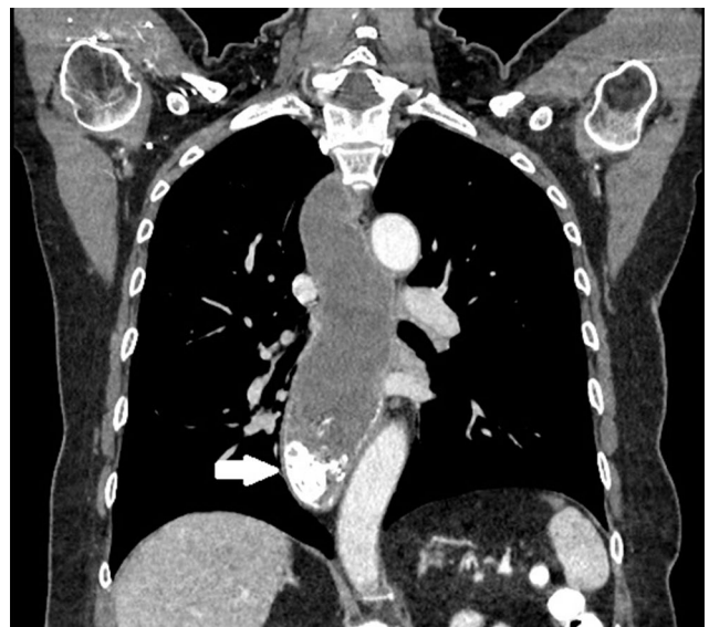
Figure 2. Contrast-enhanced thoracic computed tomography. Narrowing of gastroesophageal junction, uniform dilatation of esophagus along with esophageal contents and residue of barium sulphate (white arrow).