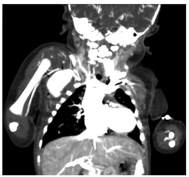
Figure 1. Contrast-filled pseudoaneurysm image in the right axillary region on computed tomography angiography.

Case 2– A female patient born via C/S at 39 weeks with a birth weight of 2900 g was diagnosed with ventricular septal defect and pulmonary atresia during echocardiographic evaluation. A written informed consent was obtained from the parent of the patient. Ductal stent placement was planned for the fourth postnatal day in the angiography