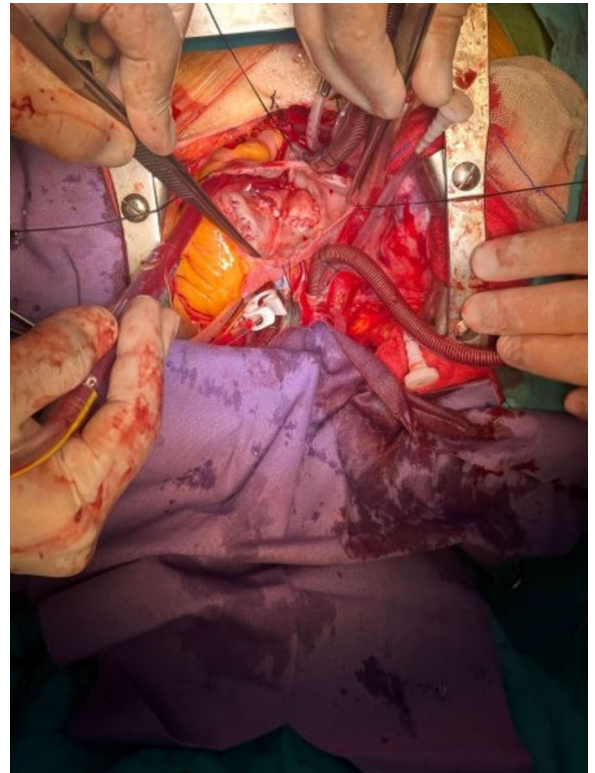
Figure 3. Postrepair image.