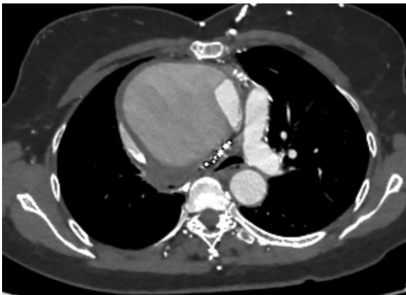
Figure 2. Pseudoaneurysm compressing the right pulmonary artery and trachea.