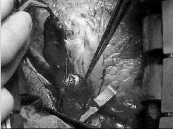
Figure 1. Macroscopic appearance of the lymphadenopathy on the ITA pedicle.

noted, which were almost round in shape, 20-25 mm in diameter and rubbery in consistency (Figure I). These masses were easily removed with sharp dissections and sent to the pathology laboratory. On macroscopic examination the vascular integrity was not impaired. Blood flow in the ITA was measured after dissection of the pedicle which was 144 ml/min while the cardiac index was 3.1 mL/min/m 2 . Using Octopus Tissue Stabilizer III (Medtronic, Inc., Minneapolis, MN) on beating heart the left ITA was anastomosed to the midportion of LAD. Finally, the operation was ended by standart closing of the chest. Following an uneventful recovery he was discharged from the hospital at the sixth postoperative day.