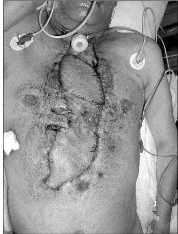
Figure 2. Sternal and mediastinal area after extensive reconstruction with free latissimus dorsi graft and skin grafts.