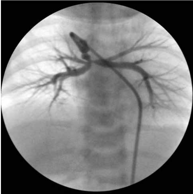
Fig. 1. Vertical and tortuous patent ductus arteriosus with stenosis at proximal part of left pulmonary artery.