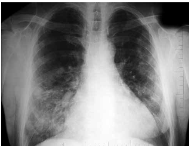
Figure 1. The chest X-ray at admission.

The prognosis for primary cardiac angiosarcomas is poor despite noninvasive radiographic methods and early surgical intervention. Life expectancy is less than six months. [3] There is very high metastatic potential,