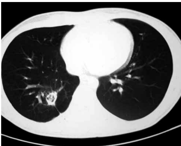
Figure 1. A thick wall and irregular internal and external borders along with radiodense areas were seen within the cavity.

The goal of surgical treatment for a hydatid cyst in the lung is to avoid resection and protect pulmonary parenchyma. This is achieved by removing of the cyst membrane, suturing the bronchial openings, and obliterating the residual cavities with sutures (capitonnage). Some surgeons have suggested that the residual cavity eventually obliterates, so good results can also be obtained without capitonnage. However, the cavity remains if the cystic cavity is left open or previously sutured bronchial openings are reopened, and this cavity may form the basis for potential aspergilloma development. [4] Similarly, in our case, although capitonnage was reported, the cystic cavity was