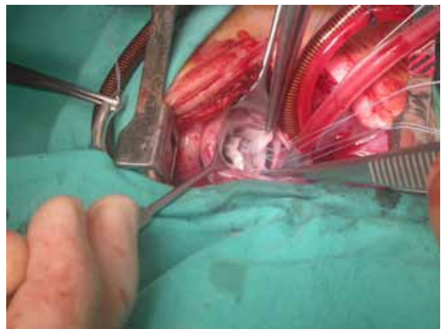
Figure 1. Operative view of teflon pledgeted ventricular septal defect sutures placed on the septal crest and passing from the bridging leaflet.

Two layers of running 5-0 Prolene sutures were used for closure of the ASD for repairs in the patients with PAVSD. The bites were passed through the septal part of the newly created tricuspid valve and then from the crest of the atrial defect. The coronary sinus drainage was left on the right atrium in its natural position. This suture line was started at the inferior part of the defect where the inferior part of the crest of the ostium primum joins the posterior leaflet. The sutures were superficial on the inferior AV valve leaflet and ran obliquely until the level