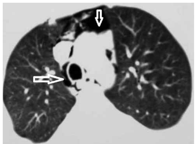
Figure 2. Thoracic computed tomography scan showing the free gas within the mediastinum anterior to the aortic arch and the peritracheal and periesophageal areas (arrows).