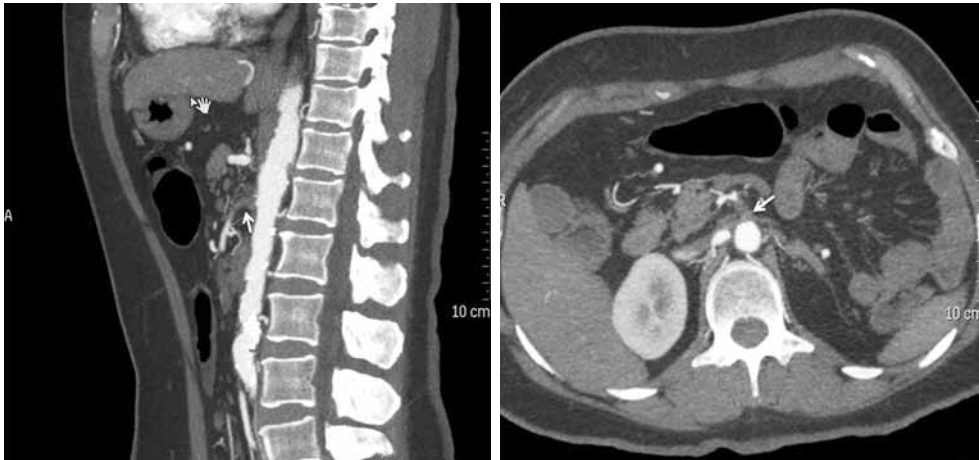
Figure 1. Computed tomography angiography demonstrates the occlusion of the origin of the superior mesenteric artery. The arrows indicate the occlusion.

lost about 15 kg in weight over the previous four years. The patient had a history of hyperlipidemia, diabetes mellitus (DM), and hypertension and had also undergone a left nephrectomy. Her vital signs at presentation were blood pressure 130/70 mmHg, heart rate 78 beats/min, and temperature 37.2 °C. An abdominal examination revealed generalized tenderness and minimal muscular defense, but rebound tenderness was not present. No abnormality was noted in the hematologic profile, renal and liver function, serum electrolytes, or coagulation profile. Multislice computed tomography angiography revealed occlusion at the origin and proximal portion of the superior mesenteric artery (SMA) and inferior mesenteric artery (IMA) (Figures 1). Digital subtraction angiography also detected the proximal occlusion of the SMA and IMA. Additionally, there was direct collateral drainage