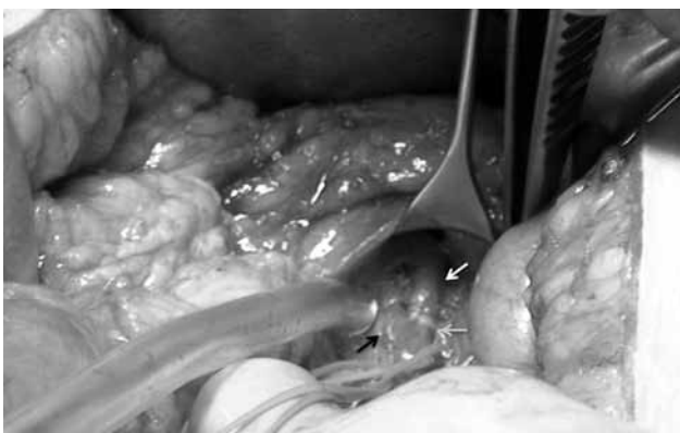
Figure 2. The operative photograph shows the splenic artery-to-superior mesenteric artery anastomosis. The white arrow indicates the splenic artery, the black arrow indicates the superior mesenteric artery, and the gray arrows indicate the anastomosis.

The patient was taken to the operating room, and the supraceliac aorta was accessed through the lesser omental sac. We decided to use the splenic artery for the SMA bypass since splenic perfusion was supported from the short gastric arteries. The celiac and splenic artery were explored, and the splenic artery was mobilized from the origin to the splenic hilum over the upper edge of the pancreas. The pancreatic branches of the splenic artery were then ligated and divided. Next, the SMA was explored from the posterior of the pancreas, and it was dissected through the distal portion in order to place a vascular clamp. There was no pulsation in the SMA. Heparin (75 IU/kg) was injected intravenously, and the splenic artery was ligated and transected near the splenic hilum. A longitudinal arteriotomy was then performed on the SMA, and there was backflow from the distal portion of the artery. In our case, the proximal part of the SMA was occluded. Therefore, a vascular clamp was placed only on the distal portion, and the splenic artery was anastomosed end-to-side to the SMA (Figure 2). The spleno-mesenteric bypass was checked intraoperatively by palpation of arterial pulsation, and the SMA pulse was present. The splenic perfusion was normal, so there was no need for a splenectomy.