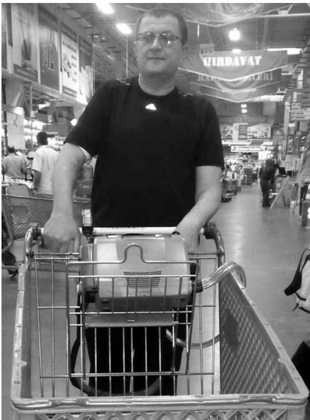
Figure 2. The patient in his daily activity 1.5 year after the implantation.

End-stage heart failure is a mortal healthcare problem with an increasing prevalence rate. Orthotopic HTx has been the gold standard therapy for these patients for decades; however, limited organ availability is a major limitation throughout the world. The difference between the supply (donor hearts) and the demand (patients on the waiting list) leads to a worsening of the clinical status or even death while waiting for the procedure, and this occurs despite close follow-up and intensive medical therapy. Therefore, the need for MCS is growing. The International