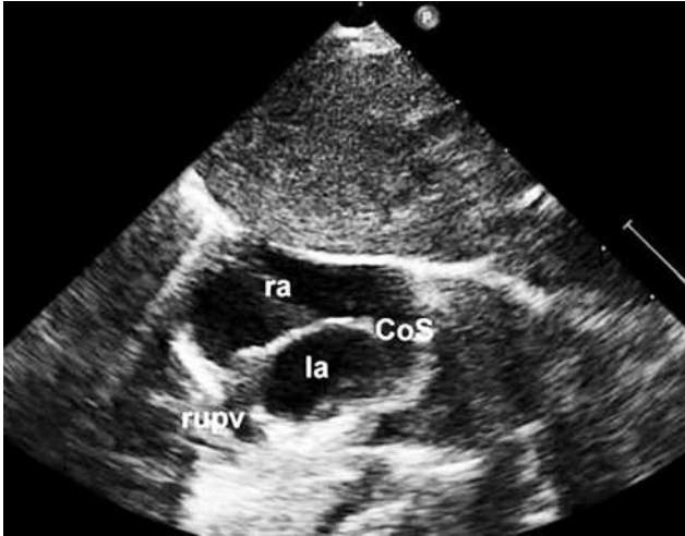
Figure 3. An echocardiographic image shows the in-position subcostal short axis. The right superior vena cava was absent, and a large coronary sinus was present. rupv: Right upper pulmonary vein; la: Left atrium; ra: Right atrium; CoS: coronary sinus.