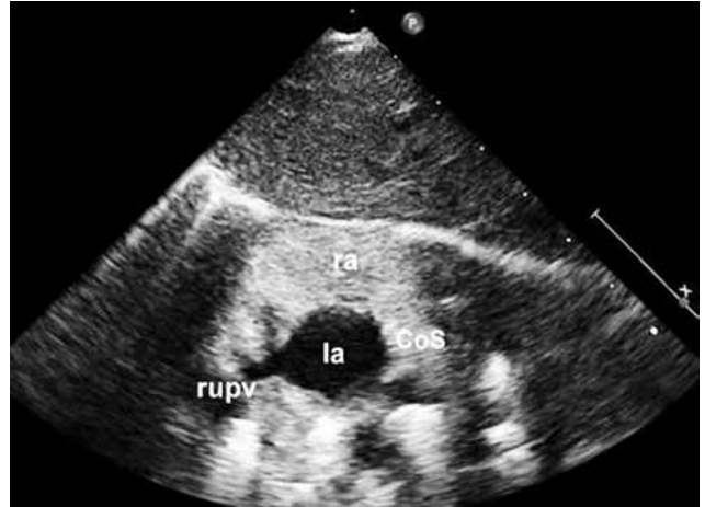
Figure 4. A contrast echocardiographic image shows the subcostal short axis position. The agitated saline filled the right atrium through the coronary sinus. The right superior vena cava was absent. rupv: Right upper pulmonary vein; la: Left atrium; ra: Right atrium; CoS: Coronary sinus.

right atrium, but an RSVC was not present. The contrast material given through the left antecubital vein passed into the coronary sinus via the PLSVC, and the right atrium was visualized (Figures 1 and 2). In addition, a 30 mmHg systolic pressure gradient was detected between the main pulmonary and left pulmonary arteries. No need for therapy was indicated, and the patient is currently being followed up.