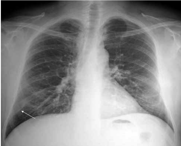
Figure 1. Chest X-ray revealed a mass-like opacity on the right ninth rib.

was planned. During the surgery, a mass with sizes of 3.5x1.5 cm with a relatively firm nature was detected on the posterior part of the ninth costa, and a total resection with enough surgical margins was performed. The postoperative histopathological findings were inconsistent with a benign nature, and infiltration of the xanthoma cells, which was destroying the rib, was noted along with cholesterol granulomas. However, the lesion showed no signs of infiltrating the lymphocytes, eosinophils, or plasma cells (Figure 4). Taking into account all of these findings, xanthoma of