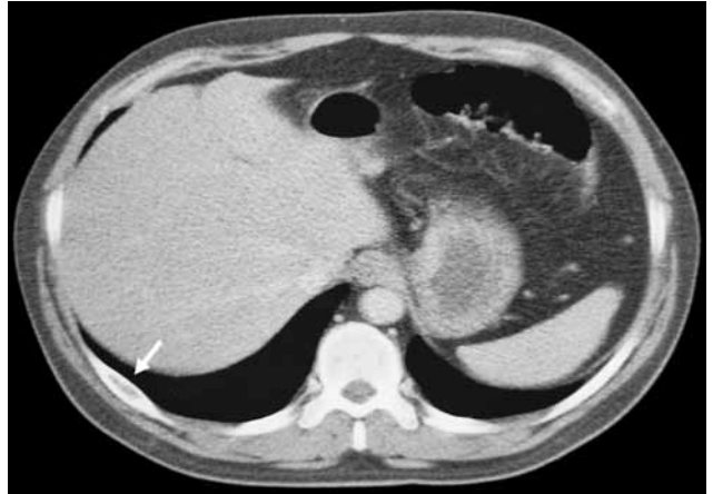
Figure 2. Thoracic computed tomography showing a small lytic lesion on the posterior arch of the right ninth rib.

the rib was definitively diagnosed. No complications were observed, and the patient was discharged on the postoperative fifth day. In addition, no further treatment was recommended except for outpatient follow-up. At the 25-month follow-up, the patient was healthy without any signs of recurrence.