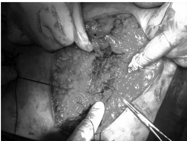
Figure 3. The closed thoracotomy.

Using our alternative technique to close thoracotomies essentially avoids the possibility of flail, dehiscence, infections, and subcutaneous emphysema while significantly decreasing acute post-thoracotomy pain, increasing pulmonary function, and promoting the early discharge of patients from the hospital.