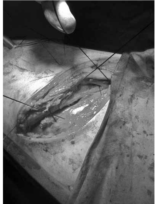
Figure 2. The thoracotomy was closed using crossed sutures.

reapproximated to their original position, and care is taken not to overcorrect, even when a rib has been resected. Blum and Fry [3] also advocate intercostal suture placement through holes drilled in the lower rib because this may minimize intercostal nerve injury and decrease postoperative pain associated with the transected muscles, spreading of the ribs, and neurovascular compression with sutures during closure. [4-7] In addition, the possibility of neurovascular entrapment and intercostal arterial lacerations should also be considered with the traditional circumcostal