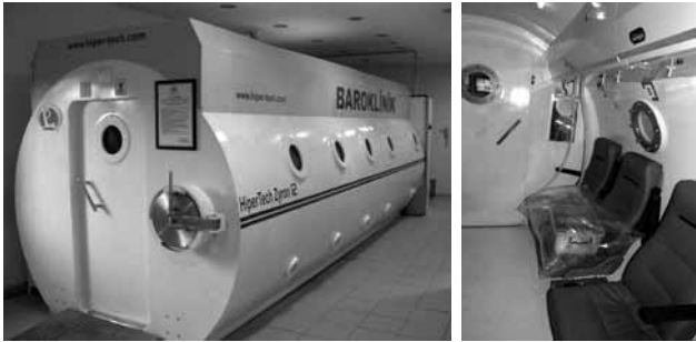
Figure 1. Photograph showing the rabbits receiving hyperbaric oxygen treatment.

a rate of 0.15 ATA/min for 10 minutes. The rabbits then received 100% oxygen at an ATA of 2.5 for 90 minutes. During these sessions, the hyperbaric chamber was flushed with 100% oxygen to prevent carbon dioxide (CO 2 ) retention. In the third step, the rabbits were decompressed at a rate of 0.15 ATA/min as described elsewhere. [9,10]