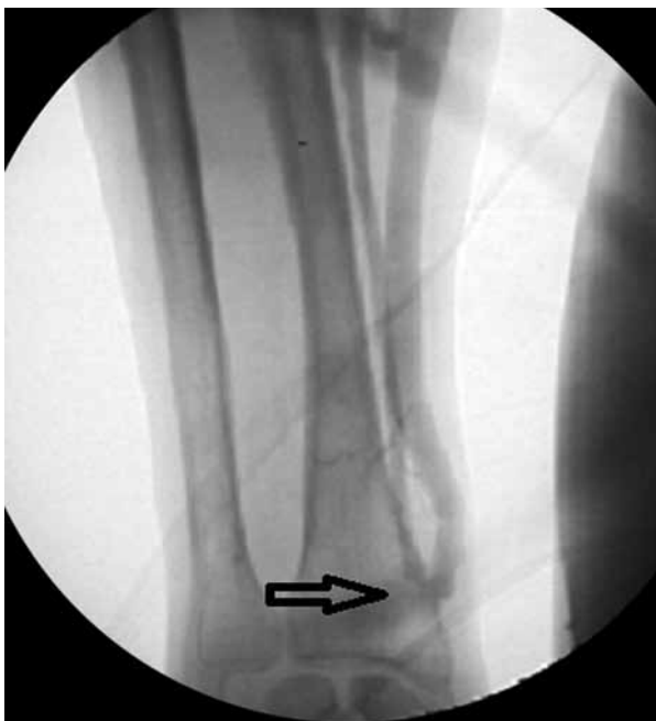
Figure 1. Conventional angiography shows the absence of antegrade radial artery flow beyond the radiocephalic anastomosis. The entire flow of the radial artery drains into the arteriovenous fistula.

Ligation of the distal radial artery was performed using a 1.0 cm incision and blunt dissection, and a 2.0 nylon suture (Ethicon Inc., Somerville, NJ, USA) was used to tie off the artery while the patient was under local anesthesia. There were no complications after the ligation, and no infections occurred at the