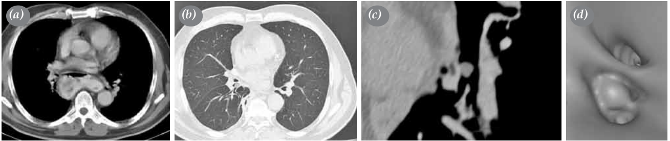
Figure 1. (a) Computed tomography section showing esophageal diverticulum hiding endobronchial mass. (b) After excision of diverticulum, a well-demarcated polypoid mass is seen in right pulmonary lower lobe bronchus, in axial images and (c) oblique coronal reformatted images and (d) virtual bronchoscopic images in thorax computed tomography.

scar was seen. Expiratory phase was prolonged. There were no pathological findings in examinations of other systems. Lung function test showed moderate airway obstruction. All the others laboratory values were within the normal ranges. A written informed consent was obtained from the patient.