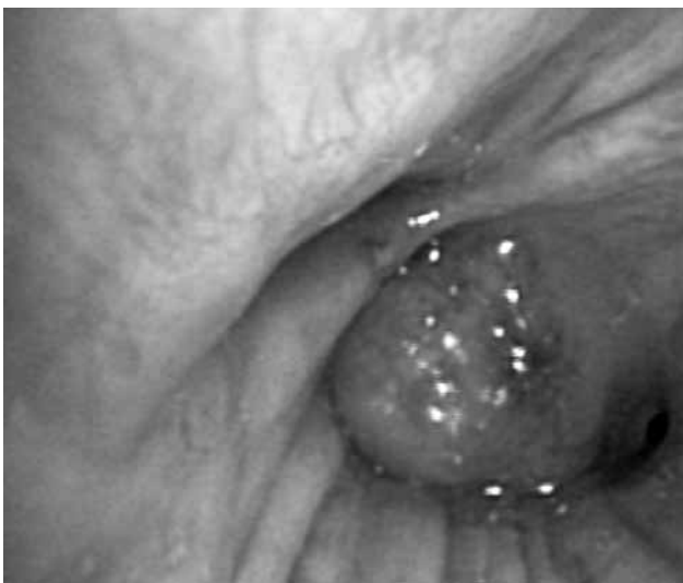
Figure 2. Fiberoptic bronchoscopy showed a well-circumscribed polypoid mass occluding right lower lobe bronchus.

There were no abnormal findings on the chest X-ray. Computed tomography of the thorax showed well-demarcated fat density (-100 to -120 HU) polypoid mass located in the entrance of right lung lower bronchus (Figure 1). Fiberoptic bronchoscopy (FOB) showed a polypoid, adipose, yellow mass with a smooth surface occluding the right lower lobe bronchus. The tumor was mobile during respiration (Figure 2). Histopathologic examination of the biopsy revealed non-specific inflammation. For final diagnosis, the patient underwent a rigid bronchoscopy. Using electrocautery snare, the polypoid lesion was enucleated. Then, argon plasma coagulation and