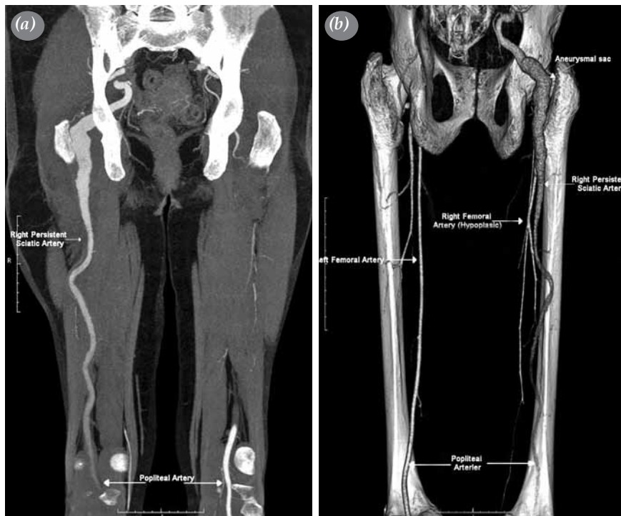
Figure 2. Magnetic resonance imaging (a) and computed tomography angiography (b) images of a 64-year-old woman presenting with right leg weakness, swelling, and pain in the upper right hip who was diagnosed with persistent sciatic artery in our clinic. Hypoplasia of the right femoral artery, right popliteal artery originating from the persistent sciatic artery, and aneurysmal segments behind the trochanter major of the femur are shown.

can be performed in certain conditions. However, the aneurysm sac, due to the collateral vessels, has a risk which is present without a thrombosed painful mass. [30] The graft interposition, femoropopliteal or transobturator iliopopliteal bypass (ringed polytetrafluoroethylene grafts or reversed saphenous vein) are the most suitable options for selected patients in whom aneurysmectomy has been performed. Percutaneous techniques have been developed and diversified in the treatment of patients. Endovascular therapy is recommended as a priority in the first-line treatment of symptomatic femoropopliteal lesions. [16,31] The closure of the aneurysm on PSA with stent graft or embolization with coils and balloon angioplasty or stent application in patients with stenosis of PSA has been applied successfully in many patients to date. [32] One-year patency of wall-covered stents used for the treatment of femoral aneurysms is 100%, while it has been reported to be 69% for the popliteal artery. This ratio rises to 80% with nitinol-covered stents. [33] In patients undergoing angioplasty or stent procedure, contralateral femoral or retrograde approach from the same side of the popliteal artery can be applied. [16]