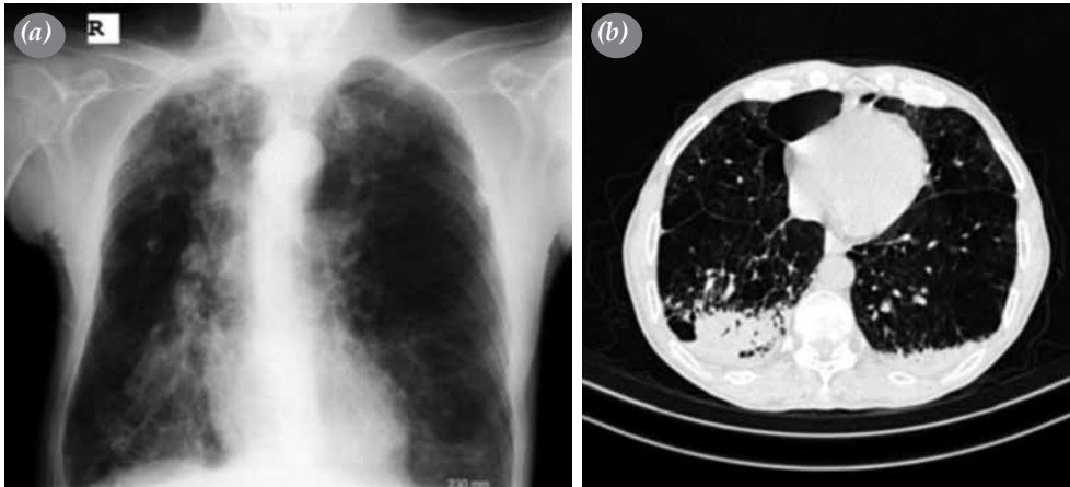
Figure 1. A chest X-ray and computed tomography scan showing (a) consolidation and (b) significant infiltrations in the right lung.

crackles in the right lung base were heard. His level of consciousness was alert.