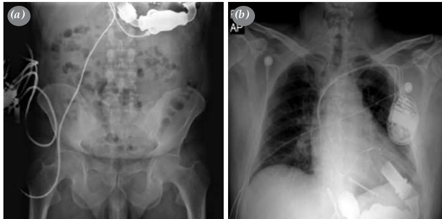
Figure 1. Left and right panels of X-ray showing no visible lesions of driveline and device.