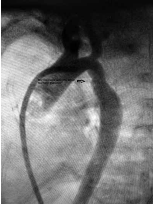
Figure 3. Coarctation zone patent after balloon coarctation angioplasty.

as they did not come for follow-up after discharge from the hospital. Three of 14 patients who underwent balloon coarctation angioplasty have been followed for a mean duration of 3.7 \pm 1.6 (range, 2.5 to 5.5) years without reintervention (Figures 1, 2, 3). The balloon coarctation angioplasty procedure was repeated in three patients, surgical repair was performed in one patient due to recoarctation, and seven months later, one patient died in the ICU after VSD operation. Two patients underwent only surgical repair due to recoarctation. A 2.5-month infant who underwent balloon coarctation angioplasty died after the Norwood surgery due to hypoplastic left heart syndrome; an 18-day-old infant who had comorbid CHDs (i.e., transposition of the great arteries, VSD, ASD, and coarctation of the aorta) died without any surgical intervention; a 12-day-old infant who had coarctation of the aorta, PDA, and severe left ventricle systolic dysfunction died in the ICU due to severe sepsis and multiple organ failure. Three patients who underwent balloon coarctation angioplasty were lost-to-follow-up.