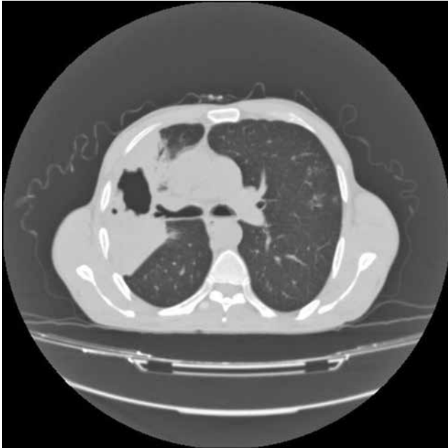
Figure 2. An axial computed tomography image showing a ruptured right lung hydatid cyst.