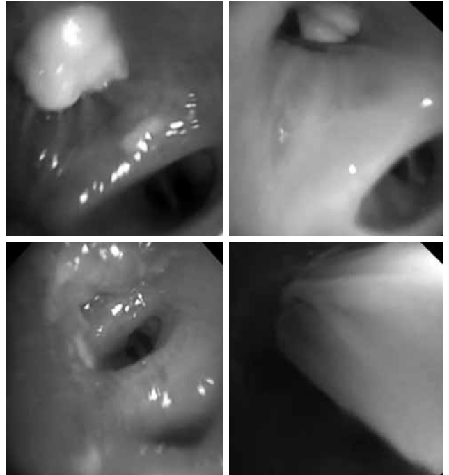
Figure 3. A bronchoscopic image showing germinal membrane in ruptured hydatid cyst.

patients, as the probability of tumor was unable to be eliminated by other methods.