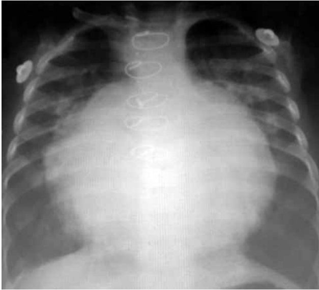
Figure 1. Chest X-ray showing significant cardiomegaly.

ventricular support. Although the PAB was performed prior to admission of this patient, the LV was still untrained, and we had to proceed with a salvage DSO; otherwise, the expected mortality would be high due to severe biventricular heart failure and cardiogenic shock.