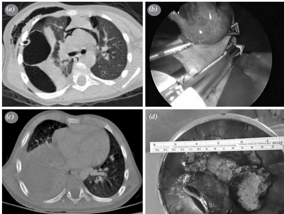
Figure 1. (a) First application, a giant bulla on thoracic CT. (b) First surgery, resection by endoscopic linear stapler of giant bulla. (c) Second application, second surgery for mass, resected tumor tissue (d) Surgical specimen (Case 1).

Histopathological examination showed neoplastic tissues consisting of spindle and some pleomorphic cells. Cystic areas were only observed as microscopic foci and tumoral tissue was completely solid. Neoplastic cells showed diffuse vimentin positivity. There was focal desmin and myogenin positivity showing rhabdomyoblastic differentiation. The result was reported as PPB type 3 in both patients.