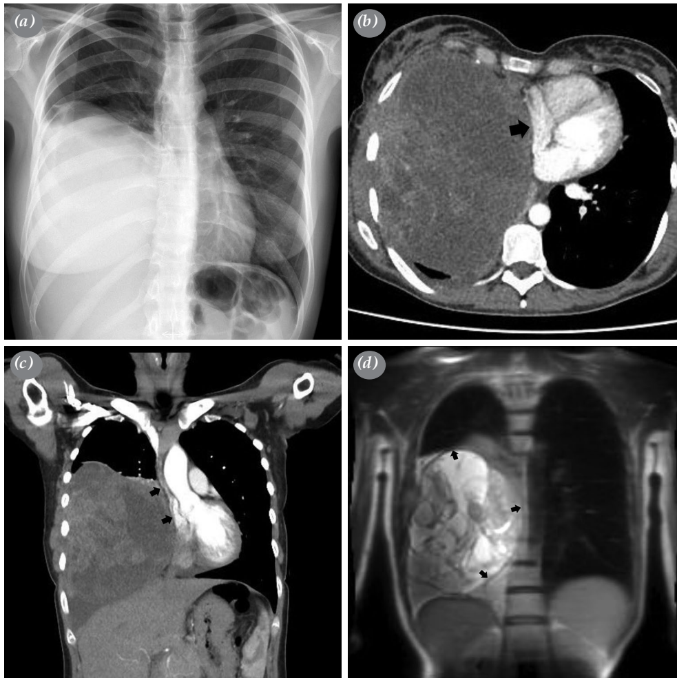
Figure 1. (a) Right-sided opacity is seen on chest radiogram. (b) Chest computed tomography revealed a right-sided giant intrathoracic mass compressing to pulmonary parenchyma and right atrium (arrow). (c) Coronal computed tomography plane evaluating the mediastinal shift caused by the compression of the giant mass (arrows). (d) According to the thoracic magnetic resonance imaging, there is no invasion in the mediastinum, diaphragm, and pulmonary parenchyma (arrows).

Therefore, right-sided posterolateral thoracotomy was planned. During exploration, the gross tumor originating from the chest wall was seen. The tumoral lesion was excised with unblock chest wall resection, included partial fifth and sixth rib excision, leaving behind a macroscopically 2-cm tumor negative margin. However, after the removal of the giant tumor, multiple metastatic lesions were observed on the atelectatic lung parenchyma. Multiple wedge resections were performed. The defect on the chest wall was repaired with a polypropylene mesh. The procedure was completed after the chest tube placement. Small round blue cells were observed in the histopathological analysis and cytokeratin,