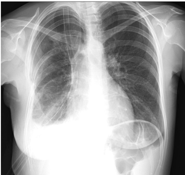
Figure 4. Postoperative chest radiogram showing the patient's symptoms in the preoperative period which regressed dramatically as the right lung began to participate in respiration and the compression on the mediastinum ended.

The mass is usually greater than 5 cm, and erosion or pathological fracture can be observed in the neighboring ribs. [5] Ultrasound or CT-guided transthoracic needle aspiration biopsy can be preferred to achieve a diagnostic sample. In our case, the patient had severe dyspnea due to the compression of the mass on the atrium and lung and, therefore, surgical resection