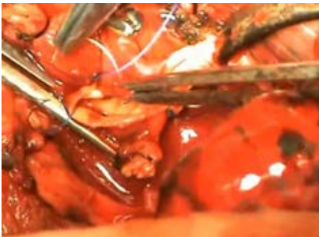
Figure 3. End-to-end vascular anastomosis was performed during circular resection of the pulmonary artery.

During the study period, 50 patients underwent PA reconstruction. Bronchial sleeve resection was performed in 20 (40%), lobectomy in 47 (94%), and bilobectomy in three patients (6%). Sixteen resections (32%) were performed on the right side and 34 (68%) on the left side. Demographic data of the patients are given in Table 1. Partial resection was performed in 45 (90%) patients (n=7 pericardial patch resection, n=33 primary suture, n=5 tangential resection with vascular stapler) and circular PA resection in the remaining five (10%) patients. All patients were operated through thoracotomy with proximal and distal Satinsky clamps. Pulmonary artery invasion originated from the tumor itself in 35 (70%) and from the lymph node in 15 (30%) patients.