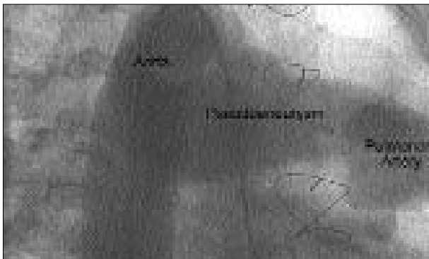
Figure 1. The aortography of the patient before her second operation. The Catheter is in the left ventricle. The pseudoaneurysm and pulmonary artery became visible after opaque injection.