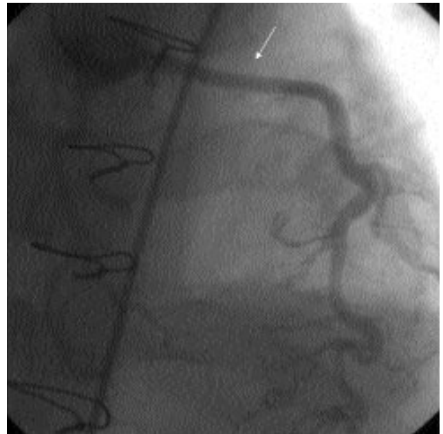
Fig. 2. A control angiogram showing the disappearance of the tortuous segment of the LAD after RVOT patchplasty.